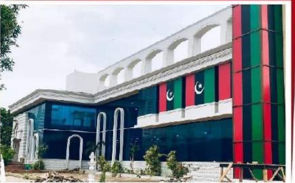
Bilawal House - Sindh Media Cell