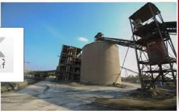
Pioneer Cement, Head Office