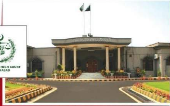
HIGH COURT ISLAMABAD