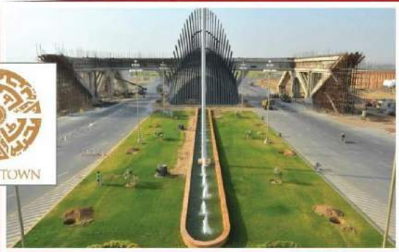
BAHRIA TOWN KARACHI