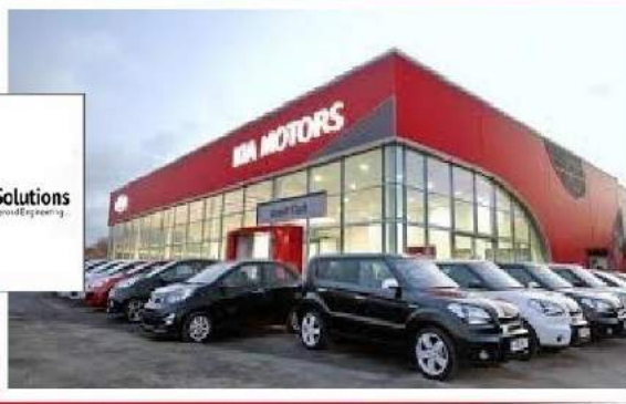
Kia Lucky Motors