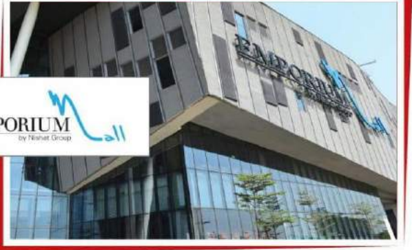
EMPORIUM MALL LAHORE