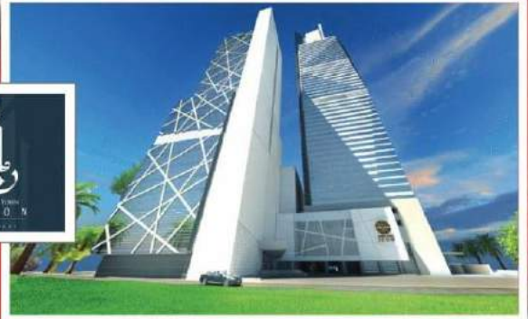
BAHRIA TOWN ICON TOWER KARACHI