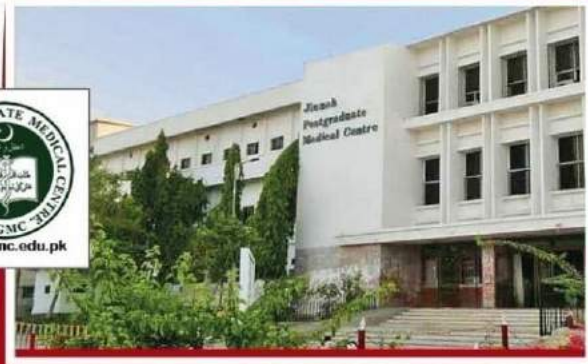
JINNAH POSTGRADUATE MEDICAL CENTRE