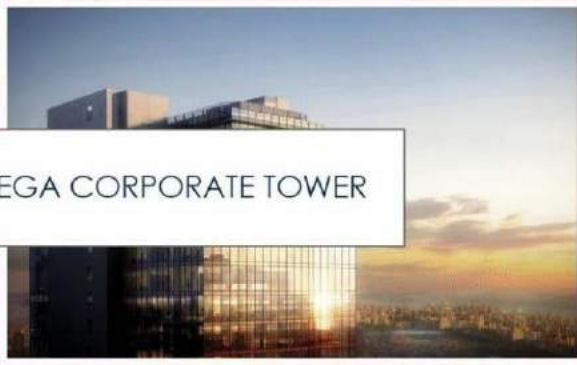
G4 TOWER KARACHI