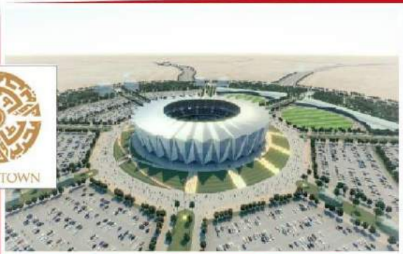
RAFI CRICKET STADIUM